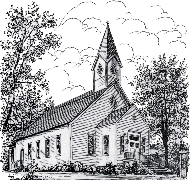
Philadelphia Presbyterian Church Clayton County, Georgia ~ Organized 1825